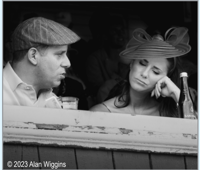
Bottle in front of man removed using AI in Photoshop Beta.

The SPS contest rules allow images to include some elements in the composition that were not created by the maker. However, there have never been any conditions specified on how these additional elements are acquired or how they are created. During the yearly review of the rules, the SPS Board discussed whether AI generated image elements should be allowed in competitions. While we all agreed that images that are completely AI generated should not be allowed there were differing opinions on using AI to create some small element of the composition. Most of the discussions centered around creativity and plagiarism. While creativity and plagiarism are a concern it became clear that these concerns are equally valid whether the image element was created using AI or created by another person. Imagine inputting a text string to an AI application to create an image element versus inputting that same text string into google to search for an image element created by another person. The level of creativity is similar if not identical and the potential for plagiarism exists in both. After much deliberation it was decided that since we already allow image elements not created by the maker then AI generated image elements would also be allowed.